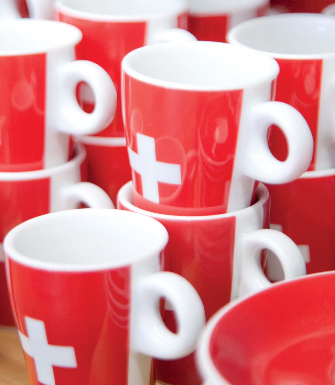
CUP GIN 0808 | 7 cl |