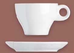
SAUCER AMB 1714 | 140 mm |