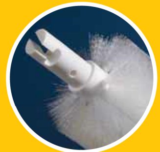
Brushes fit securely into slots for durable brush attachment — no tab to break off