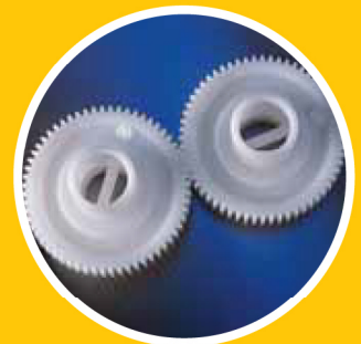
Heavy-duty Celcon® gears stand up to years of washing